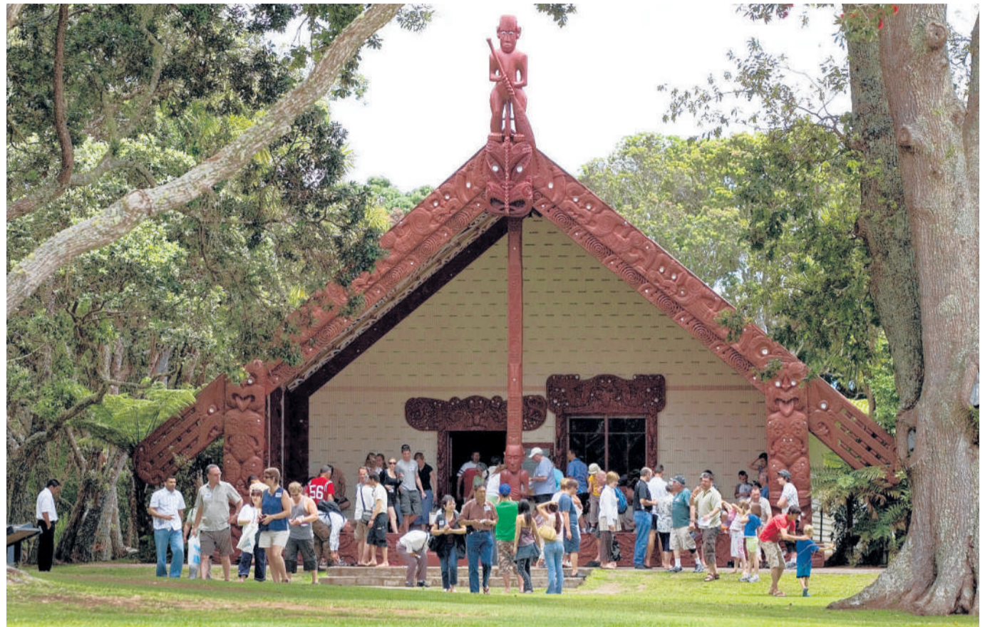
Tourists gather outside Te Whare Runanga at the Waitangi Treaty Grounds, in the Bay of Islands; below, page one of the Treaty of Waitangi.

This is today's first tick on my Northland Passport: I'm collecting the set of mission houses. These are the buildings that remain from settlements established in the early 1800s by the missionaries, men who were necessarily as